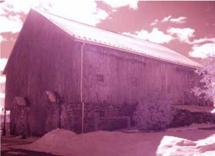
Above: IR shot of the barn, which served as a field hospital.

We raved about our experience here for days afterward, and would recommend the Battlefield B & B to anyone with a love of history, fine accommodations, furry friends and hauntings! Check out their site at gettysburgbattlefield.com